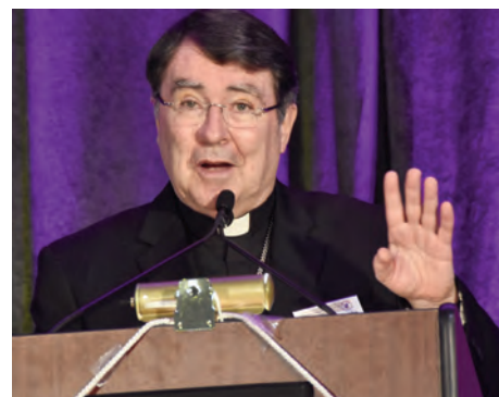
Archbishop Christophe Pierre, Apostolic Nuncio to the United States, was one of the prime motivators behind the symposium.

“We must be able to live in tension between the poles and form a creative tension in openness to the Spirit to find the path forward to many of the world’s problems. This polarity affords us the opportunity to dialogue, and through dialogue, discover the truth... This symposium