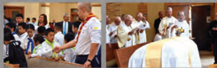
Vietnamese worship community celebrates