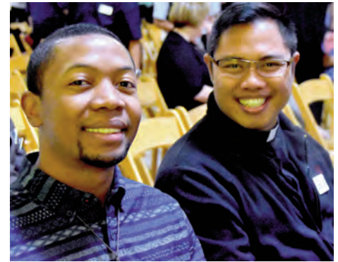
Many of our students – those in formation (seminary and novitiate) and in the ESL program – were able to attend the symposium.