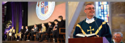
"Discovering Pope Francis," Pope Francis Symposium at