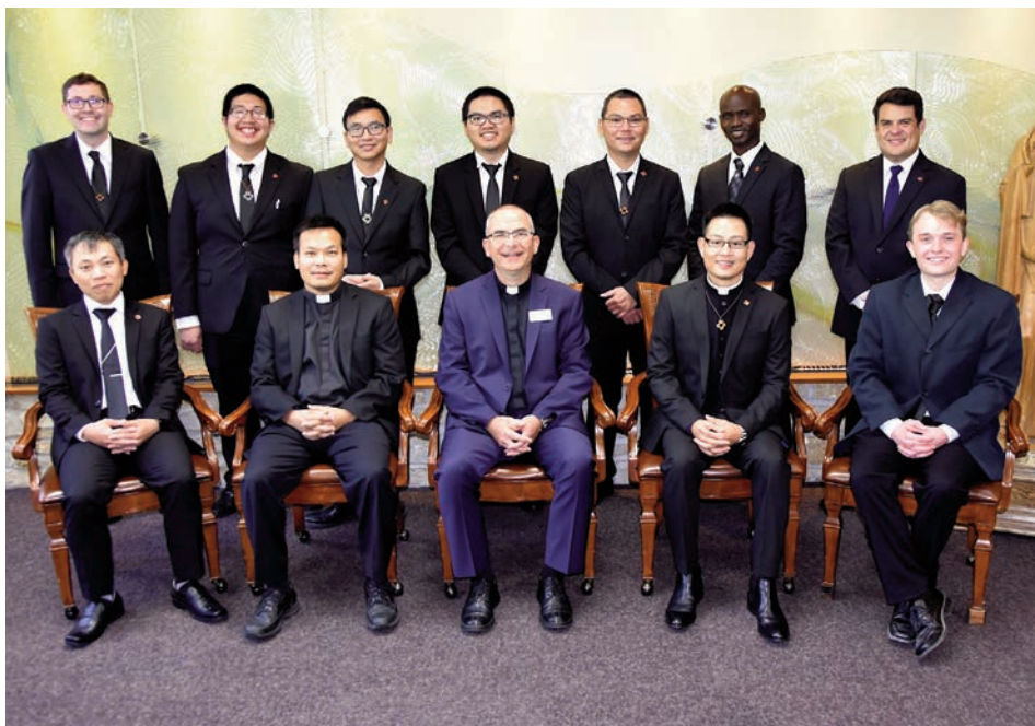
Our 2021-22 Formation Community